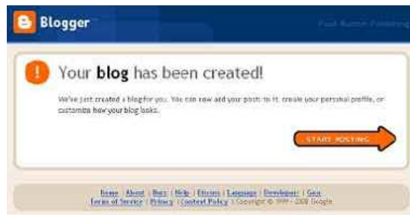
Figure 6 : Your blog has been created.

Your blog is now live and ready for you to start writing content.